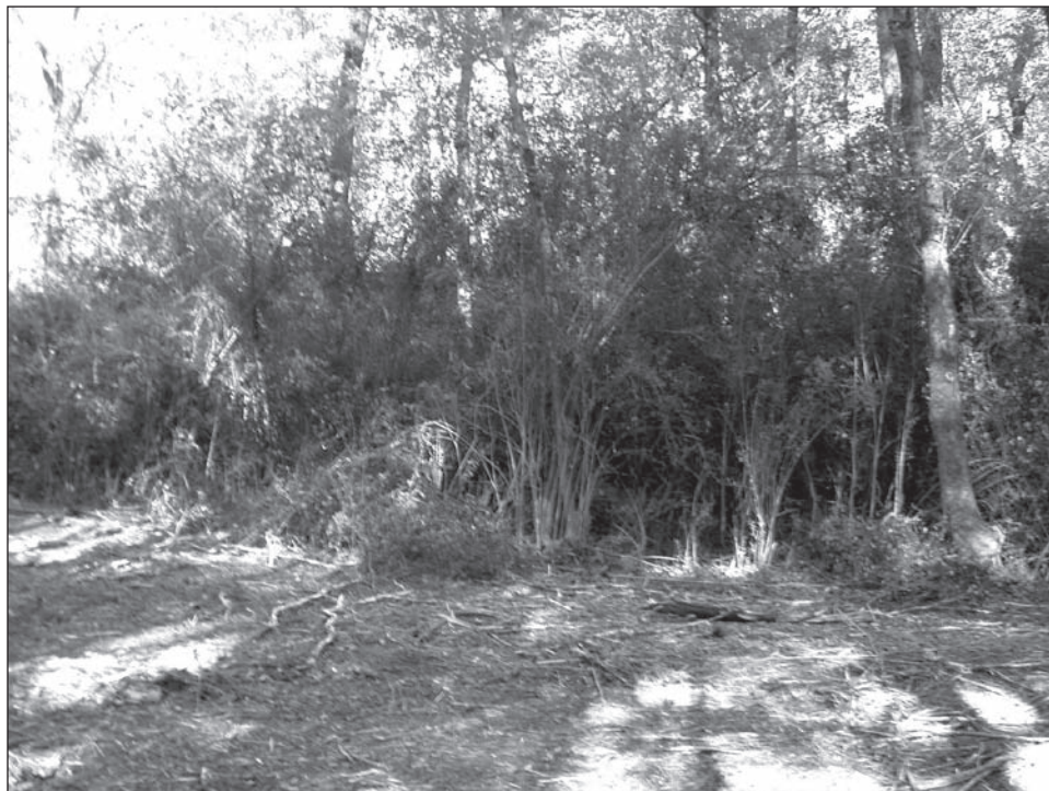
Figure 1—Site 1: Pretreatment.