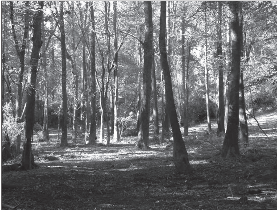
Figure 2—Site 1: Post-treatment.