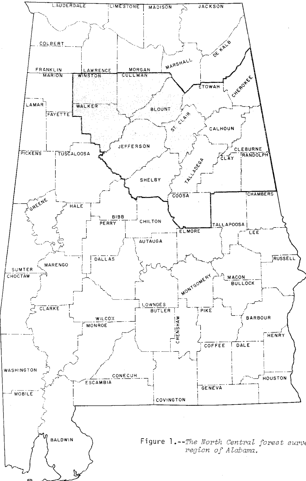
Figure 1.--The North Central forest survey region of Alabama.