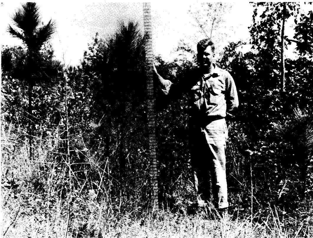
Figure 4.--Slash pine seedling free to grow.