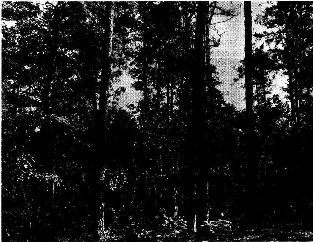
Figure 1. --Merchantable stand of shortleaf pine with understory hardwoods.