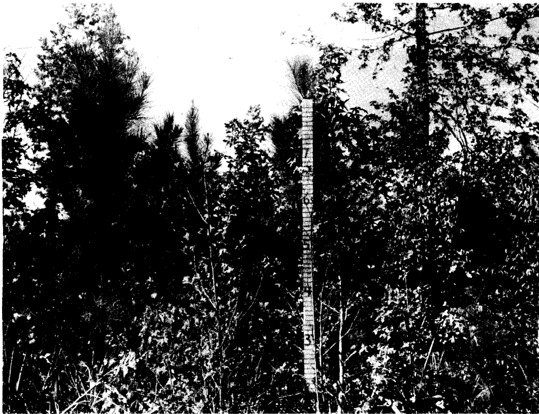
Figure 3.--Loblolly pine seedling outgrowing hardwoods on check plot.