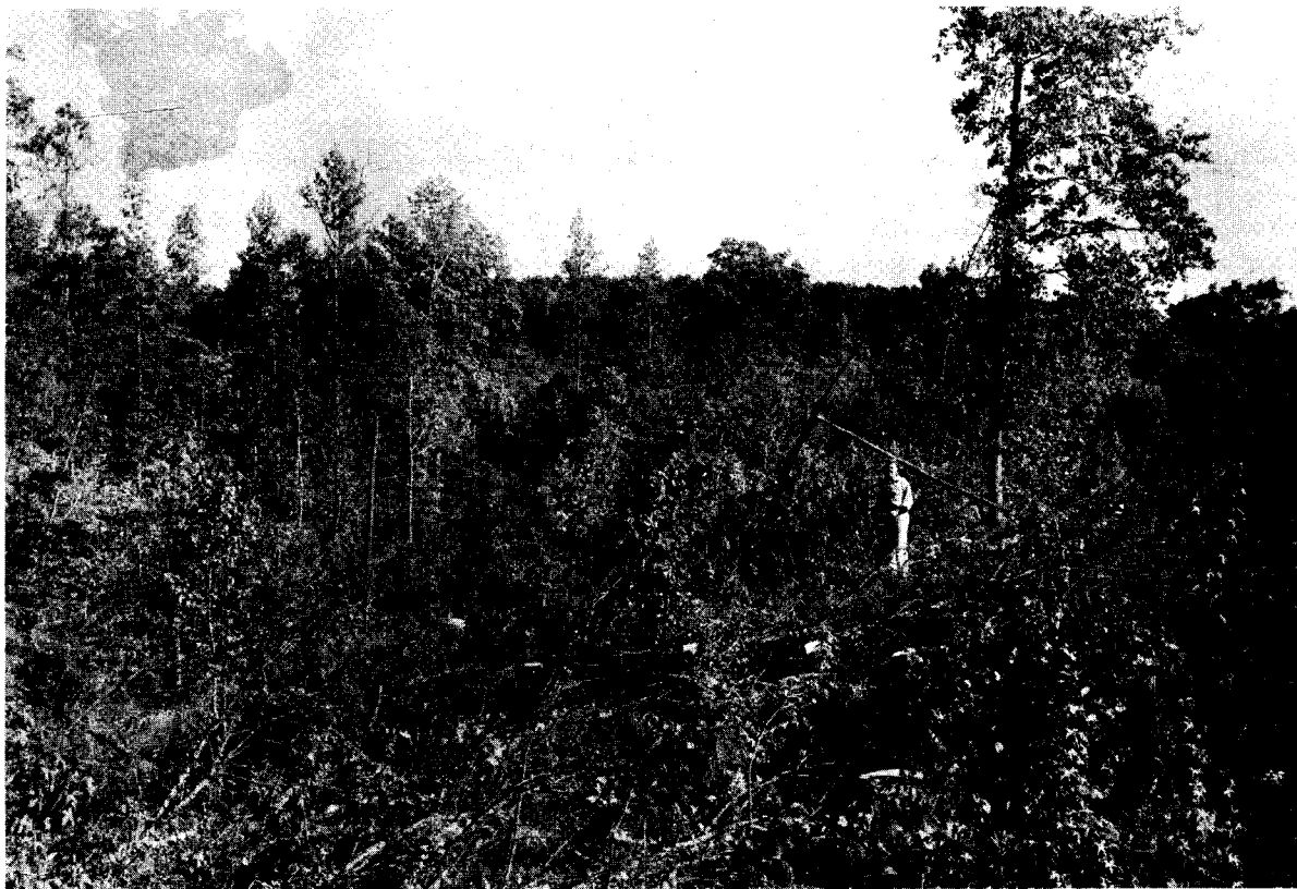
Figure 2. --Pine overstory clear cut. Hardwoods dominate the area.