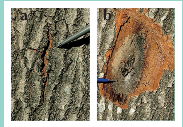
Figure 3. – Fungal mats on oak: (a) crack in bark caused by fungal mat, (b) exposed fungal mat on Spanish oak.

Live oaks tend to grow in large dense groups (called motts) with interconnected roots. The fungus may be transmitted from one tree to another through these root connections. Root transmission is a proven means of spread from one live oak to another. As a result, patches of dead and dying trees (infection centers) are formed. Infection centers among live oaks in Texas