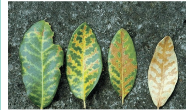
Figure 2. – Live oak leaves showing oak wilt symptom known as veinal necrosis.

Oak wilt diagnoses may be confirmed by isolating the fungus from diseased tissues in the laboratory. Samples can be submitted to: Texas Plant Disease Diagnostic Laboratory, 1500 Research Parkway, Suite A130, Texas A&M University Research Park, College Station, TX 77845. A county extension agent, Texas Forest Service forester, or trained arborist should be consulted for proper collection and submission of samples.