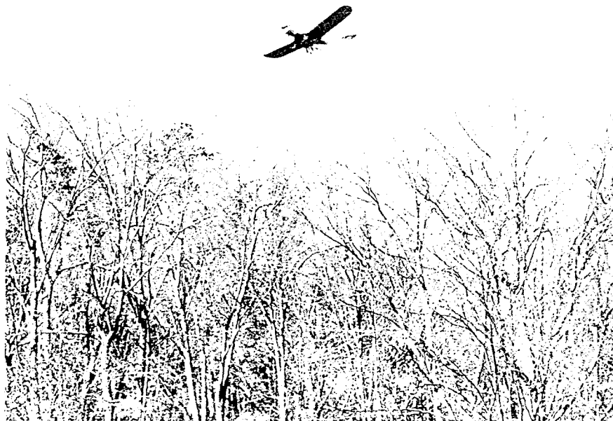
Expenses incurred for an activity carried out to produce income as either a business, or an investment, can generally be recovered as income tax deductions.

Certain woodland owners may have a special interest in wildlife and manage their property to attract certain species. In some regions of the country, wildlife expenditures may be related to the production of income because the land is leased for hunting. These costs, for example, would in-