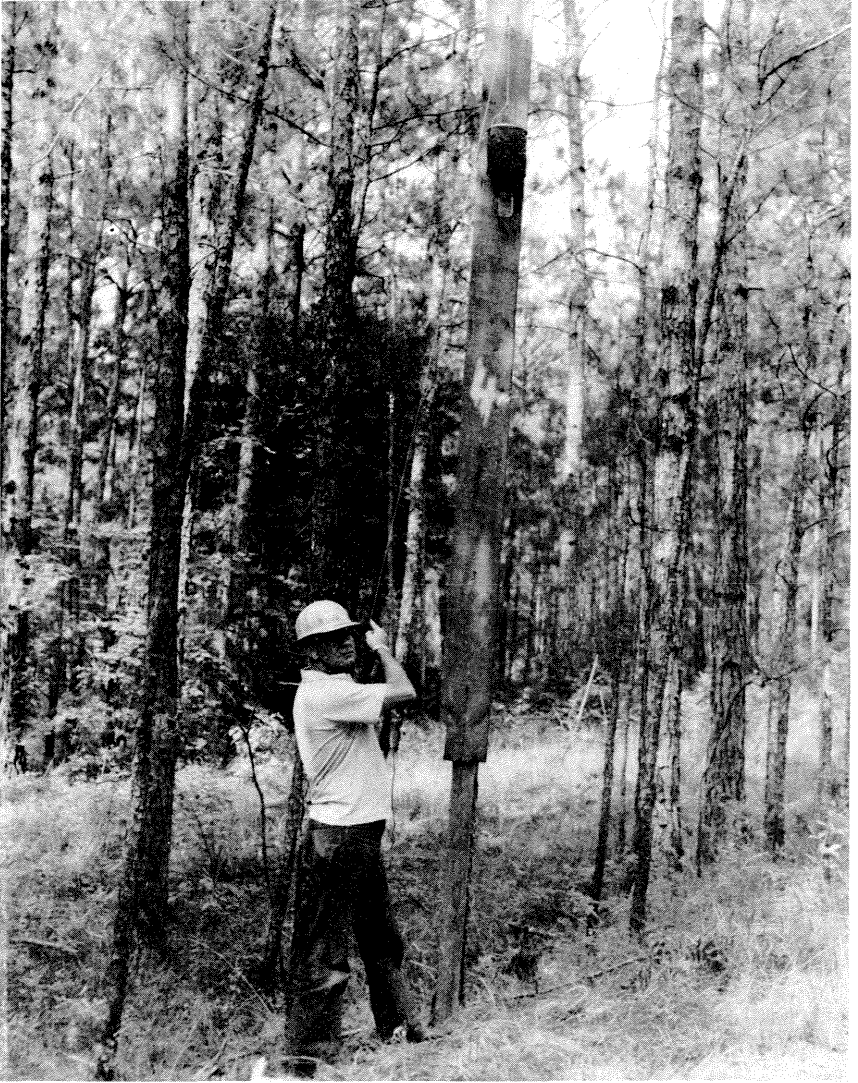
FIG. 2. Field placement of bucket trap.

Traps were initially hung with strings from tree branches, but very few beetles were captured until a vertical silhouette was added. Subsequently, buckets were suspended about 4 m high from pulleys against 1 \times 30 \times 400 -cm plywood boards (Fig. 2). These "artificial trees" had the added advantage of being highly mobile.