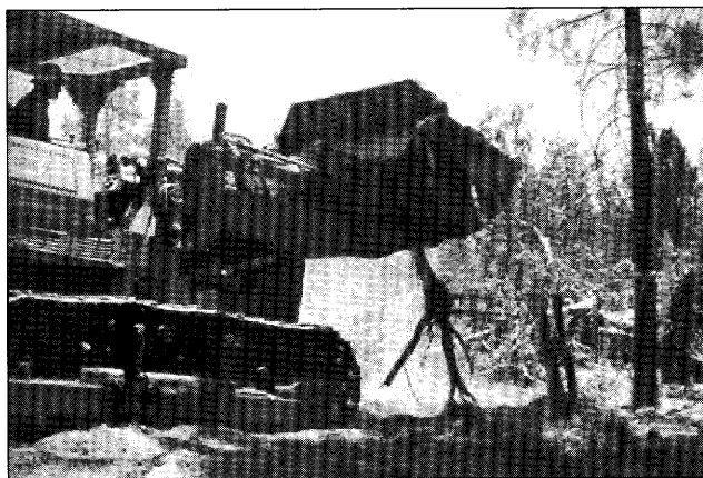
Figure 2. Smaller diameter Jeffrey pines were pulled out with the bucket of the loader.

Two methods to remove trees larger than about 12 in. dbh were tested. Stems were either pushed over with the raised bucket (Figure 3), allowing the weight of the tree to dislodge the roots from the soil; or the stems were cut and the remaining stump and roots then lifted out. Pushing over