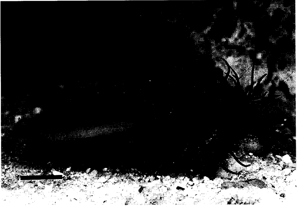
FIG. 2.—Gravid female V. vibex displaying mantle margins in the laboratory. The individual was collected from Shoal Creek, Cleburne Co., Alabama on 11 March 1997. Scale bar = 1 cm.

packets in contrast to those of L. perovalis (Haag et al. , 1995). Another female, similarly oriented in the substrate, trailed a short length of mucous strand (about 20 cm); the glochidial packets apparently were torn away, or otherwise detached. Neither female was displaying mantle flaps while producing superconglutinates or mucous strands, but in both, well-developed mantle flaps, similar to those seen in displaying females, were visible lying retracted, anterior to the siphons. Two detached superconglutinates were found snagged on woody debris in the stream, but the females that produced them were not identified.