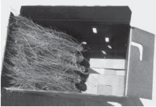
Figure 4 —Seedlings are placed into wax-coated boxes for storage and shipment. Boxes are generally designed for produce and have slits or holes for ventilation and hold between 125 and 400 seedlings.