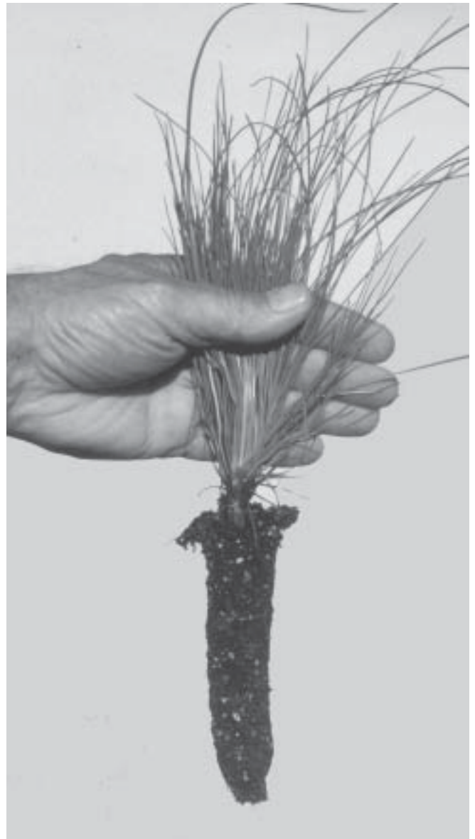
Figure 2 —Typical longleaf pine container seedling.

Nearly 40 million seedlings are being grown at the 4 nurseries in the southeastern US we surveyed. About 82% of the container seedlings are longleaf pine, followed by 10% loblolly, 6% slash, with 2 nurseries growing about 600,000 “other” seedlings representing 27 species (Table 1; Aiking 2003; McRae 2003; Parkhurst 2003; Pittman 2003). In the South, seedlings are generally outplanted within 2 windows: “summer” which includes April through August (particularly the