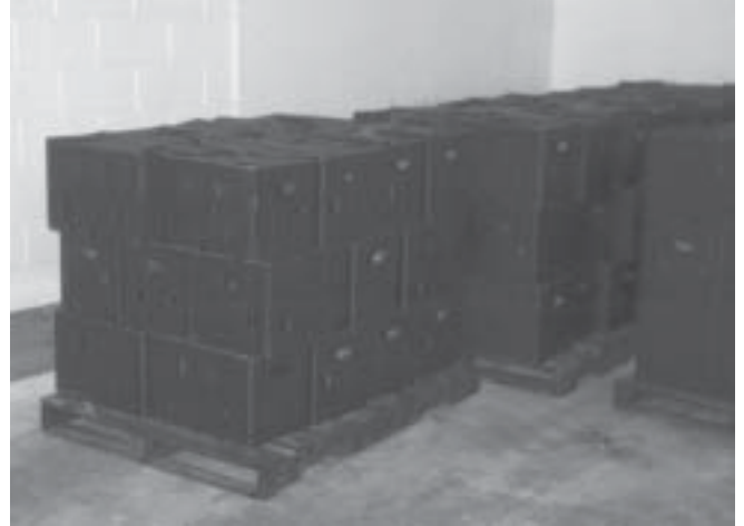
Figure 5 —Once extracted, seedlings can be held for short periods in refrigerated storage until planting.

types of questions should lead to enhanced seedling quality. And, quantifying physiological and morphological characteristics and how they interact during various storage conditions and lengths would be helpful for determining when and for how long seedlings could be stored. Ideally, this type of research would follow seedlings all the way to the outplanting site.