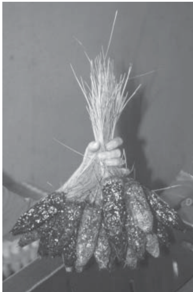
Figure 3 —Seedlings are extracted by hand.

optimum foliar nitrogen, or even the range of suitable nitrogen concentrations, is still unknown. We see a need to document the influence of growing seedlings at lower irrigation frequencies to improve water use efficiency and hasten development of cold hardiness in late summer. Answering these