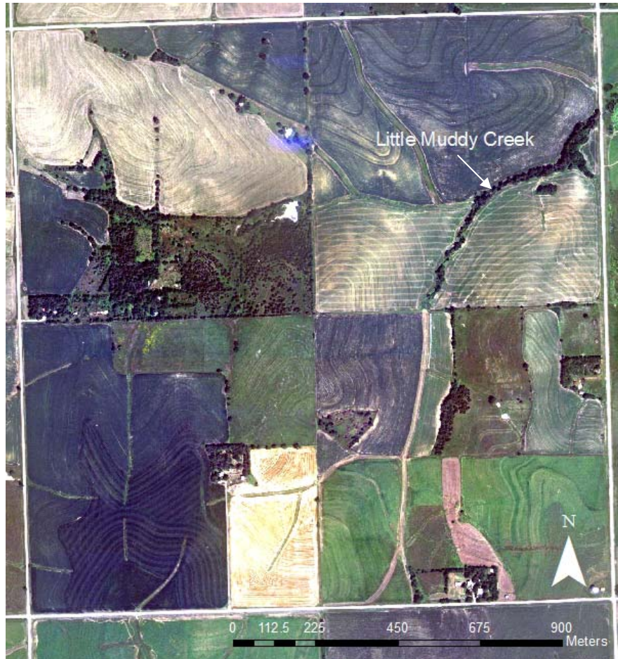
Figure 1. Aerial photograph showing the extent of terracing on one section (256 ha) which encompasses most of the Little Muddy Creek upper watershed area.