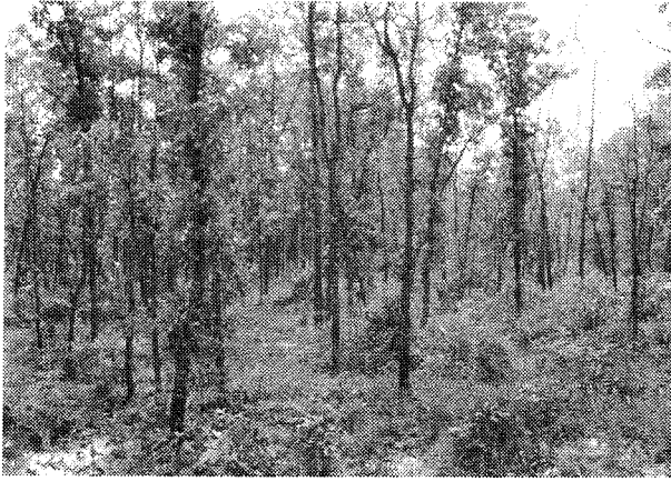
Former longleaf pine site invaded and occupied by oak.

been recorded in many longleaf pine communities (Peet and Allard 1993). A large number of these plant species are restricted to, or found principally in, longleaf pine habitats. Not surprisingly, many animal species also depend on longleaf pine ecosystems for much of their habitat, including two increasingly rare animals that are important primary excavators. Tree cavities created by red-cockaded woodpeckers ( Picoides borealis ) and ground burrows dug by gopher tortoises ( Gopherus polyphemus ) provide homes for a variety of secondary users such as insects, snakes, birds, and mammals (Engstrom 2001; Jackson and Miltrey 1989).