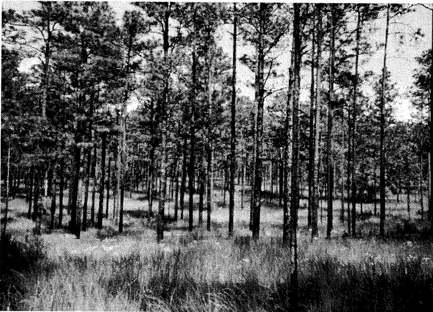
Figure 32.2 Longleaf pine bunchgrass ecosystem on xeric sandhills.