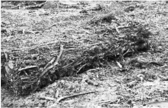
Figure 4.—A slash bundle produced by the 1490D Slash Bundler.