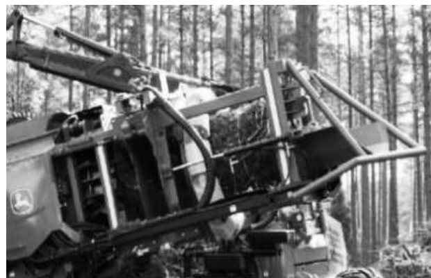
Figure 2.—John Deere B380 Bundler unit, which makes a continuous compressed residue log (bundle).

unnecessary for use in southern, whole-tree harvesting operations. With whole trees being transported to the landing, the forest residues are readily available for a stationary bundler. A better application for the John Deere B380 would be for it to be mounted on a trailer and fed by the loader on the landing. The exclusion of the forwarder will result in far less capital and fewer operating costs.