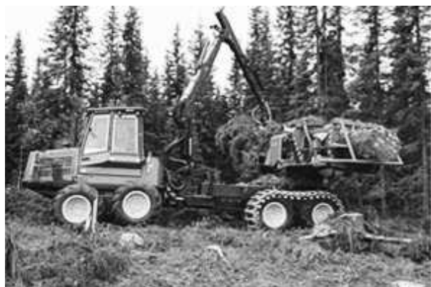
Figure 1.—John Deere 1490D Slash Bundler. The machine features a bundling unit with a forwarder for mobility.

The John Deere Slash Bundler was originally designed to be used in applications with cut-to-length harvesting systems that require it to travel within a stand to collect the residues. John Deere currently manufactures the 1490D, which consists of a B380 biomass bundling unit mounted on a forwarder chassis (Figs. 1 and 2). This machine has a current list price of approximately $600,000. The standard configuration of the bundler unit mounted on a forwarder is