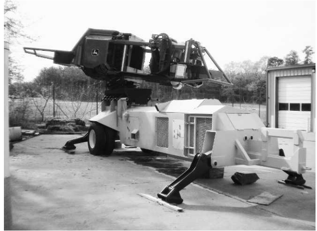
Figure 5.—Trailer-mounted B380 bundling unit.

The tree-length logging operation consisted of two loaders with pull-through delimiters, two skidders, and one feller-buncher. Typically, the feller-buncher would maintain a one-half to a full-day buffer ahead of the skidders. When pulling trees to the landing, skidders would remove the limbs from the trees using a delimiting gate. Trees would then be cleaned up and topped on the landing by the pull-through delimiters. In this manner, the skidders had to maintain two areas: remove slash from the delimiting gate and also remove slash from the pull-through delimiters on the landing. All of this forest residue was returned to the woods. During bundling operations, delimiting was performed strictly on the landing with pull-through delimiters, and the skidders moved the slash and tops to the TMB. This alteration in the operation produced a higher concentration of slash at the landing and potentially affected the skidders' productivity. In order to quantify the change in production caused by bundling and the adjustments in the delimiting process, a work study was performed on the skidders prior