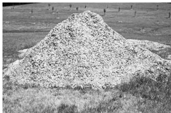
Figure 3.—Wood chip piles do not facilitate drying.

To reduce costs, maximize efficiency, and implement a bundler in a tree-length harvesting operation, this project tested a prototype harvesting system. The objectives of this research project were to (1) adapt the John Deere B380 bundler unit to a motorized trailer, (2) design the optimum landing configuration, and (3) conduct a time-and-motion study of the bundler unit.