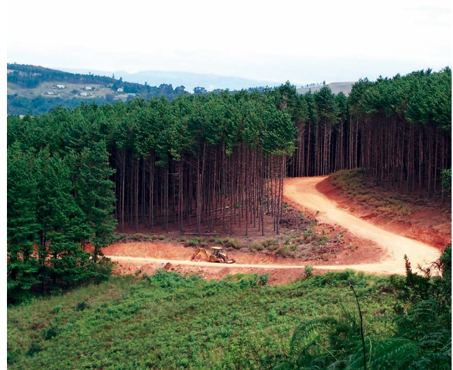
Pine plantation in South Africa

Plantation forests are becoming increasingly common and represent approximately 7% of the world's total forest area (Payn et al., 2015; FAO, 2015). Highly managed conditions, which include stand fertilisation, thinning, regular tree spacing, genetically improved growing stock, controlled burning and other practices, are designed to increase the growth rate and wood quality (Fox et al., 2004). Management practices increase growth by maximizing leaf area and growth efficiency (Waring, 1982). Increased leaf area can increase water demand by trees (Scott et al., 2004).