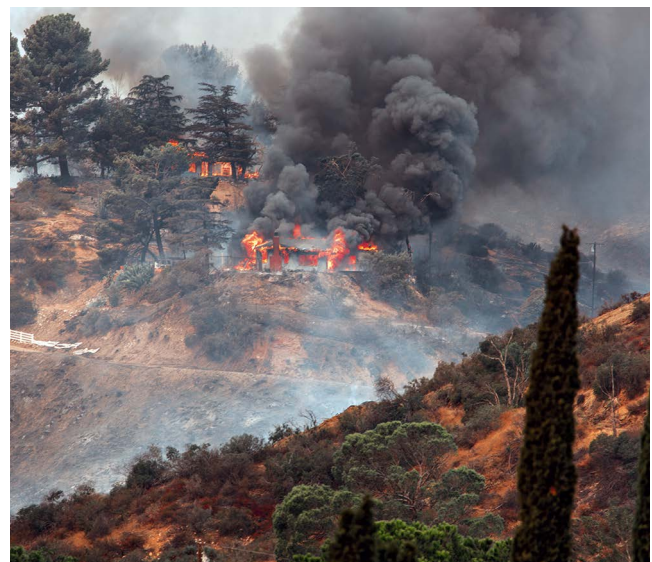
La Tuna wildfire in Los Angeles, CA in 2017

In the immediate aftermath of wildfires, the burnt soil is bare and dark, and highly susceptible to erosion,