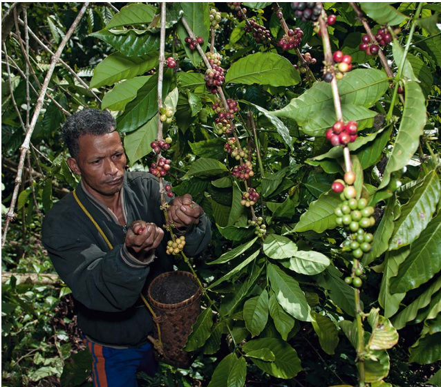
Coffee is a commodity of the Wae Rebo people in East Nusa Tenggara, Indonesia. Their coffee plants are directly adjacent to natural forests