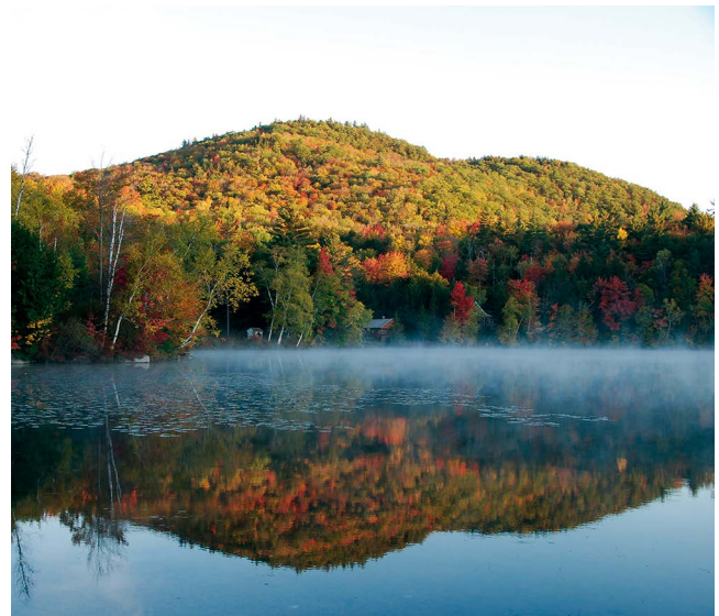
Mirror Lake near Hubbard Brook Experimental Forest (West Thornton, New Hampshire, US)

Forest vegetation succession provides strong negative feedbacks that make permafrost resilient to even large increases in air temperatures. However, as seen in boreal forests of Alaska, climate warming is associated with reduced growth of dominant tree species, plant disease and insect outbreaks, warming and thawing of permafrost, drying of lakes, increased wildfire extent, and increased post-fire recruitment of deciduous trees. These changes have reduced the effects of upland permafrost on regional hydrology (Chapin et al., 2010). Surface water, in contrast, provides positive feedbacks that make permafrost vulnerable to thawing even under cold temperatures (Jorgenson et al., 2010). In watersheds with low permafrost, base flow is higher, and annual water yield varies with summer temperature, whereas in watersheds with high permafrost, annual water yield varies with precipitation (Jones and Rinehart, 2010). With climate warming and loss of permafrost, stream flows will become less responsive to precipitation and headwater streams may become ephemeral (Jones and Rinehart, 2010).