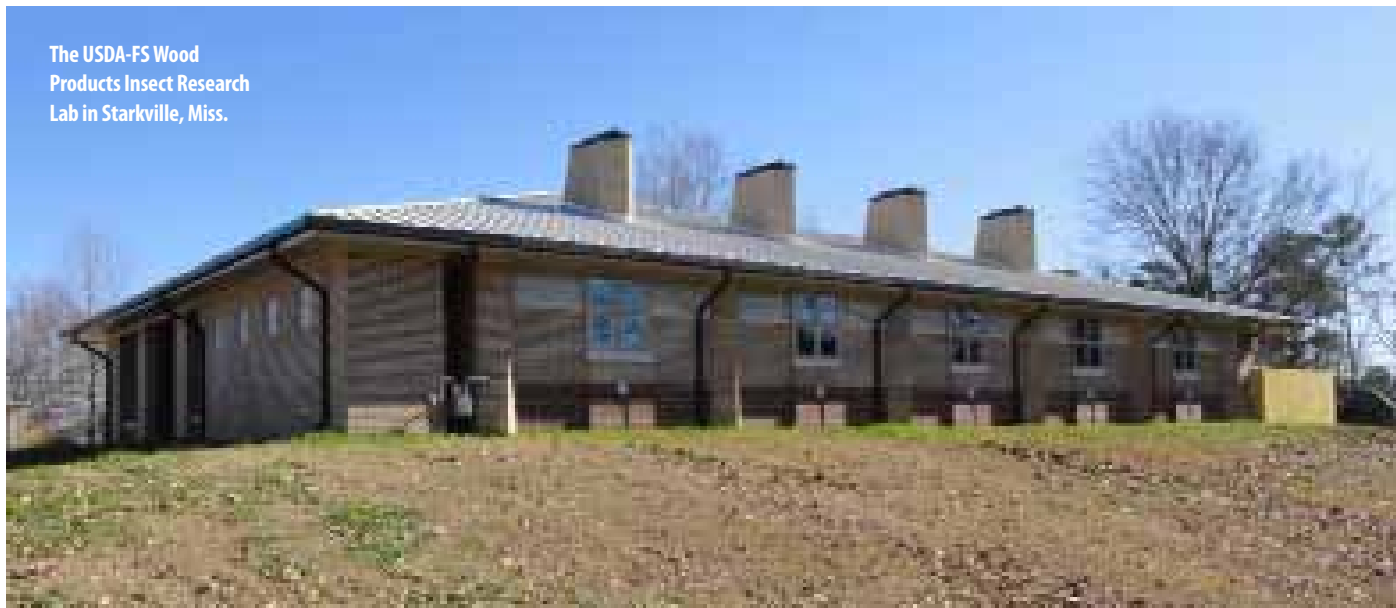
The USDA-FS Wood Products Insect Research Lab in Starkville, Miss.

The ground board test consists of a pine board centered in a 17-inch-by-17-inch plot of exposed treated soil, replicated 10 times at all test concentrations and at each of four test sites in Arizona, Florida, Mississippi and South Carolina. The concrete slab test consists of a 17-inch-by-17-inch plot of treated soil covered by a 21-inch-by-21-inch concrete slab.