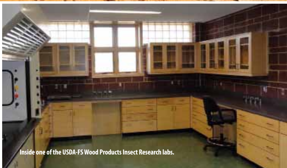
Inside one of the USDA-FS Wood Products Insect Research labs.

In 2009, the EPA chose to go through a rule-making process to develop the new federal product performance standards that control termiticide registrations. This work isn't limited to termites; it involves insecticides labeled for use against other pests of public significance such as mosquitoes, bed bugs, cockroaches, ants and ticks. Because of this, multiple EPA divisions have been involved in the process. The Office of Pesticide Programs is working to finalize a proposed product performance rule that will define the new performance standards for termites and public health pests. When completed, the draft will be made available for public comment.